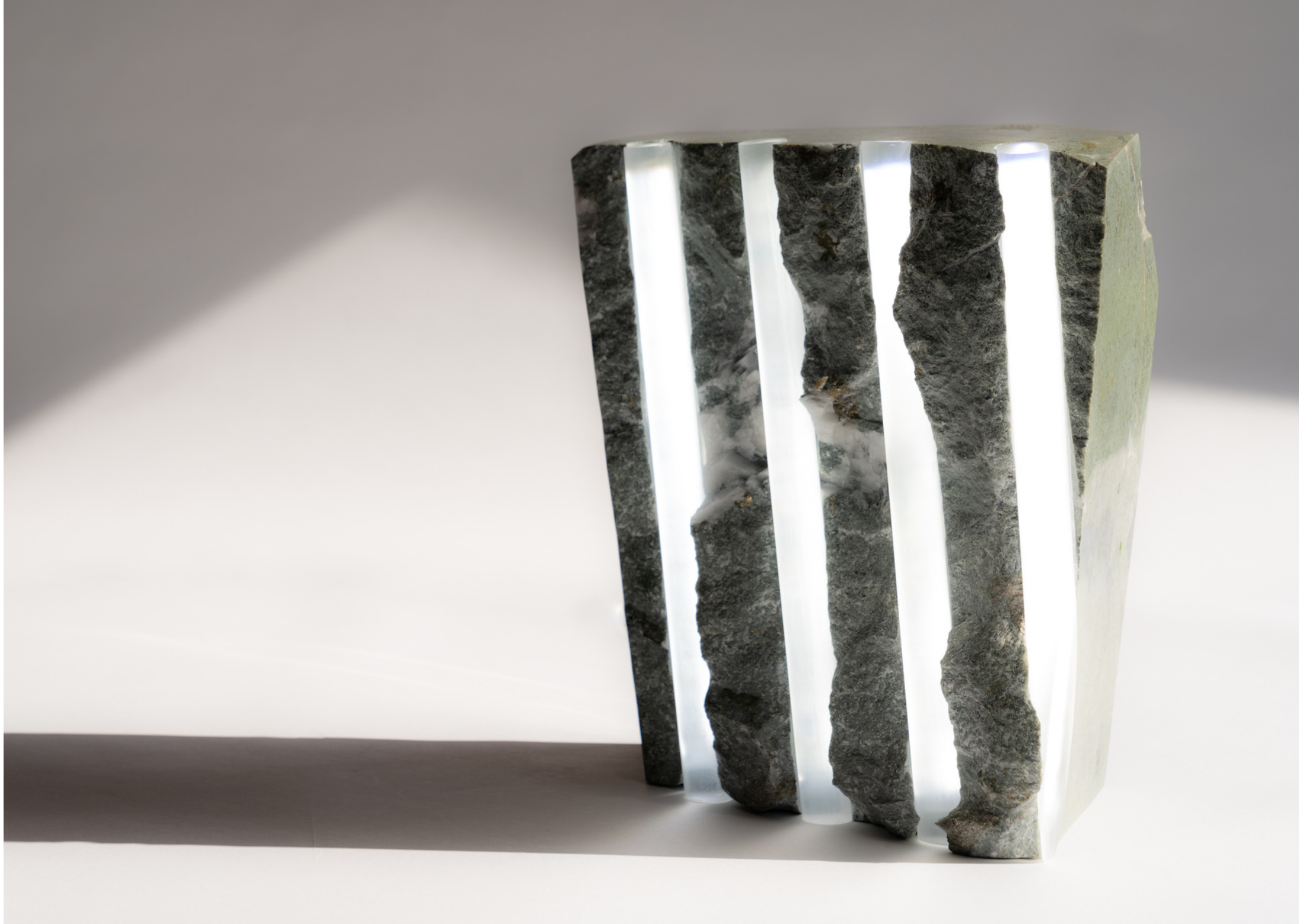
RHEA , 2021 Italian green marble and acrylic rod backlit with LED 12 x 6 x 12 in.