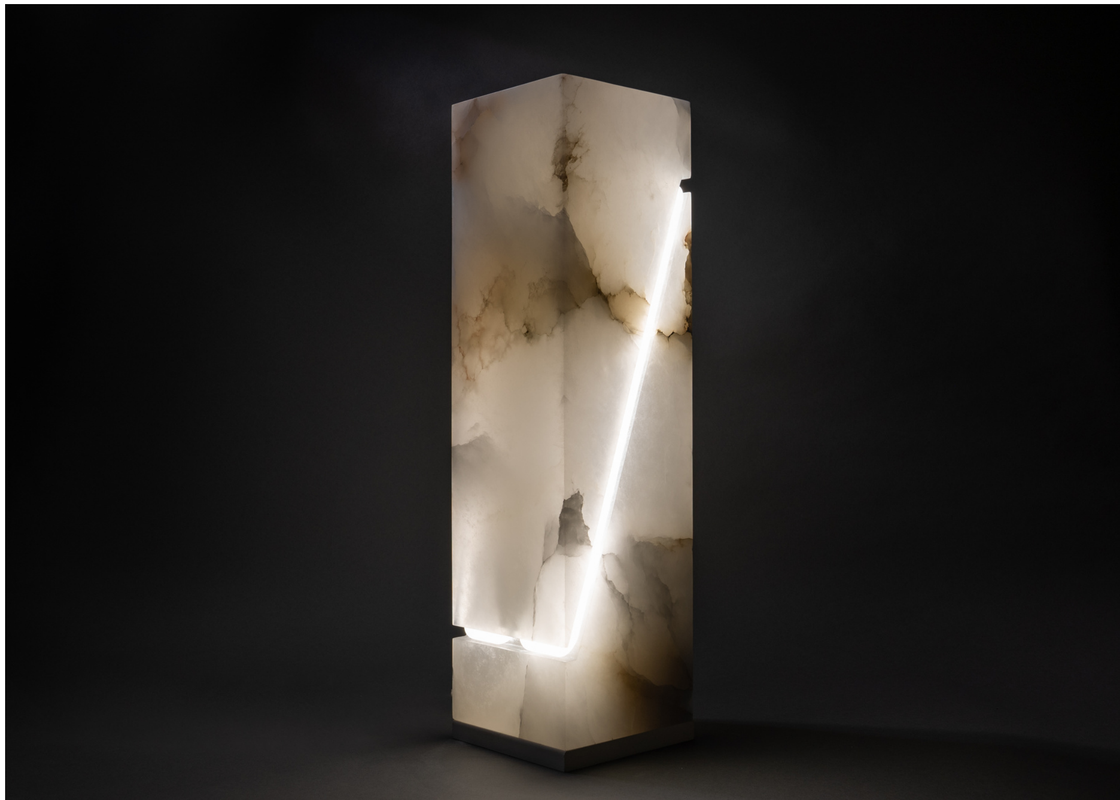
DIONE , 2019 Italian alabaster and triphosphor coated glass filled with argon and mercury 6 x 6 x 25 1/2 in.