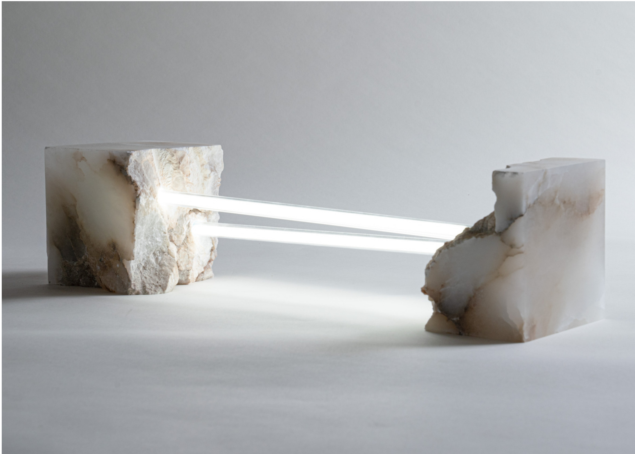
DAPHNIS , 2020 Italian alabaster and triphosphor coated glass filled with argon and mercury 24 x 6 x 6 in.