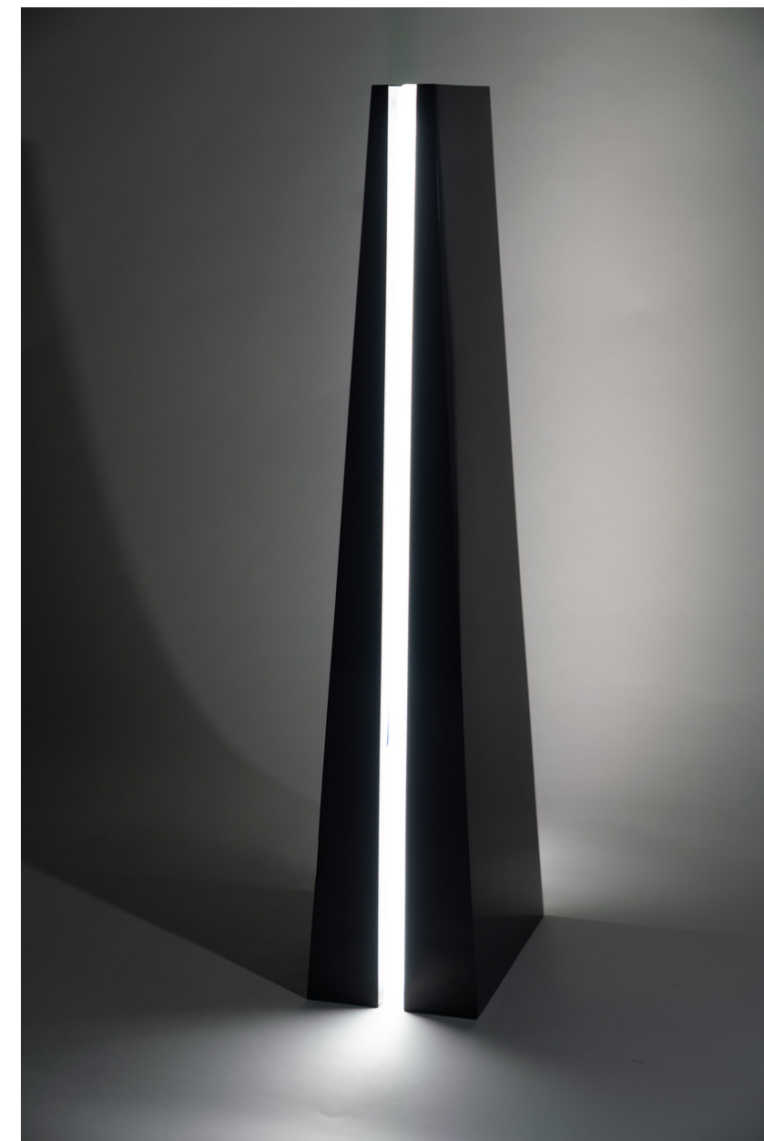
AEGAEON , 2021 Resin and LED 6 x 9 1/2 x 29 in.