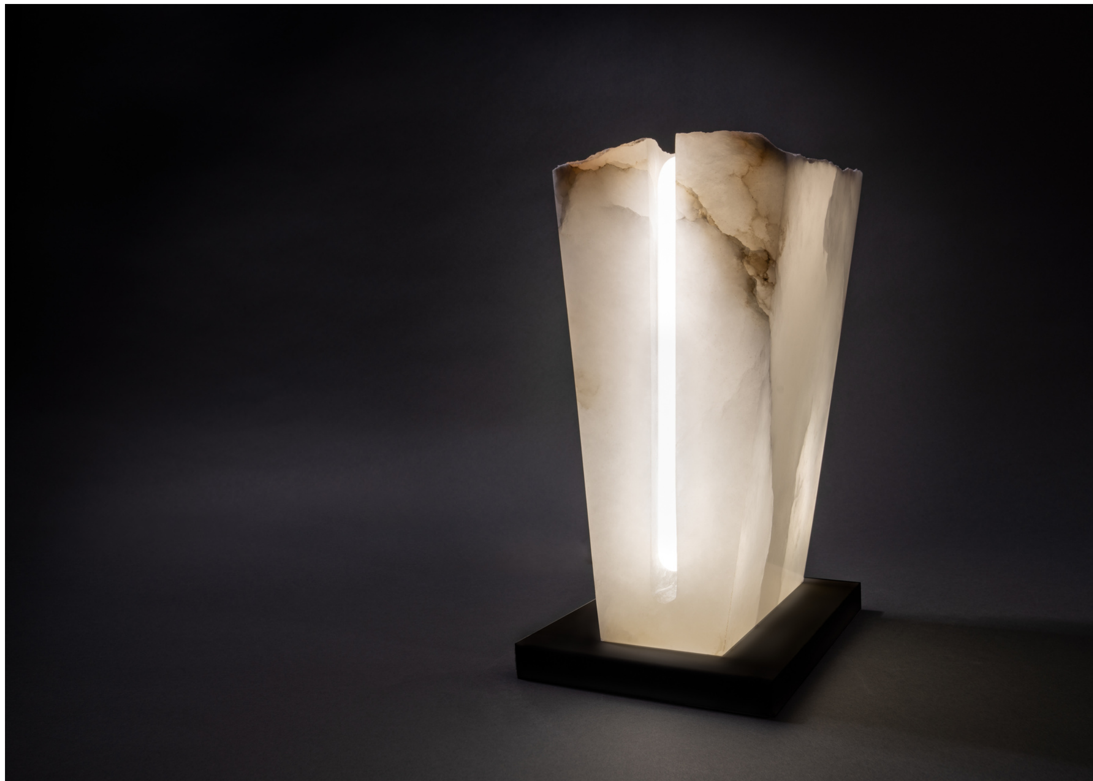
MIMAS , 2021 Italian alabaster and triphosphor coated glass filled with argon and mercury 12 x 6 x 12 in.