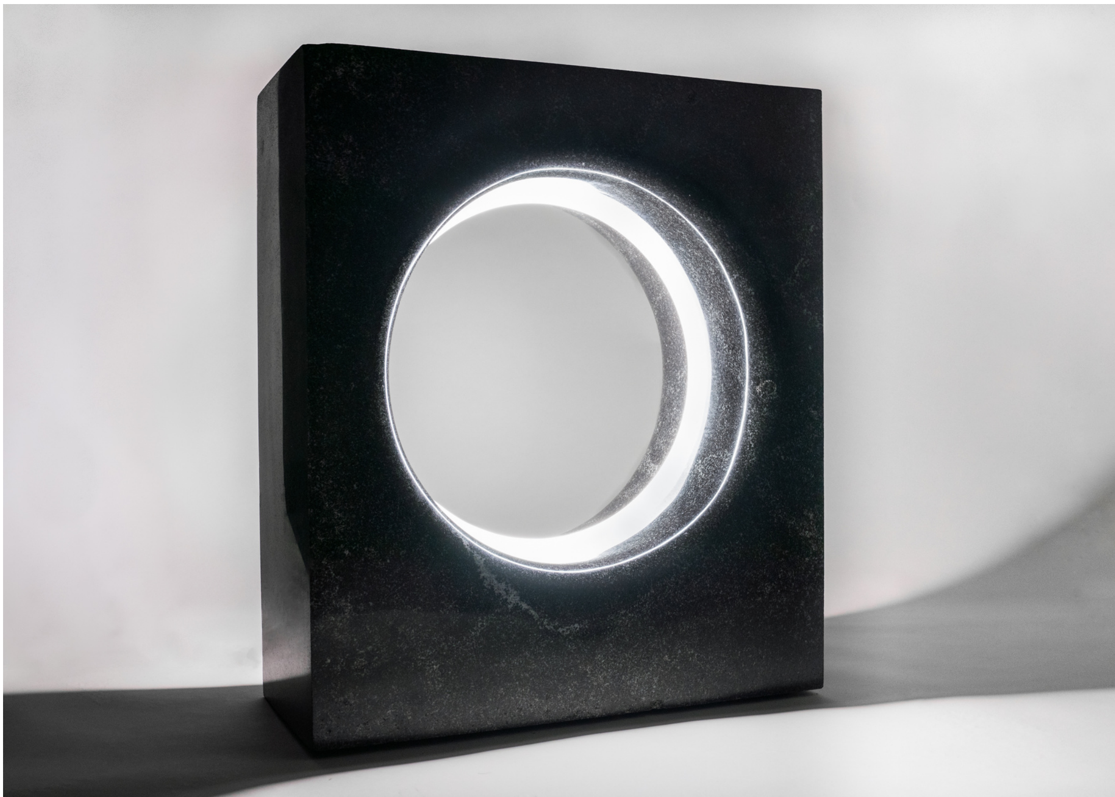
IAPETUS , 2020 Maine black granite and resin backlit with LED 7 x 17 x 19 in.