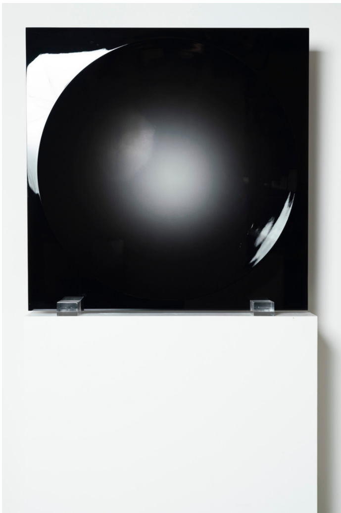
NGC 2787, 2021 Resin 40 x 40 x 2 in.