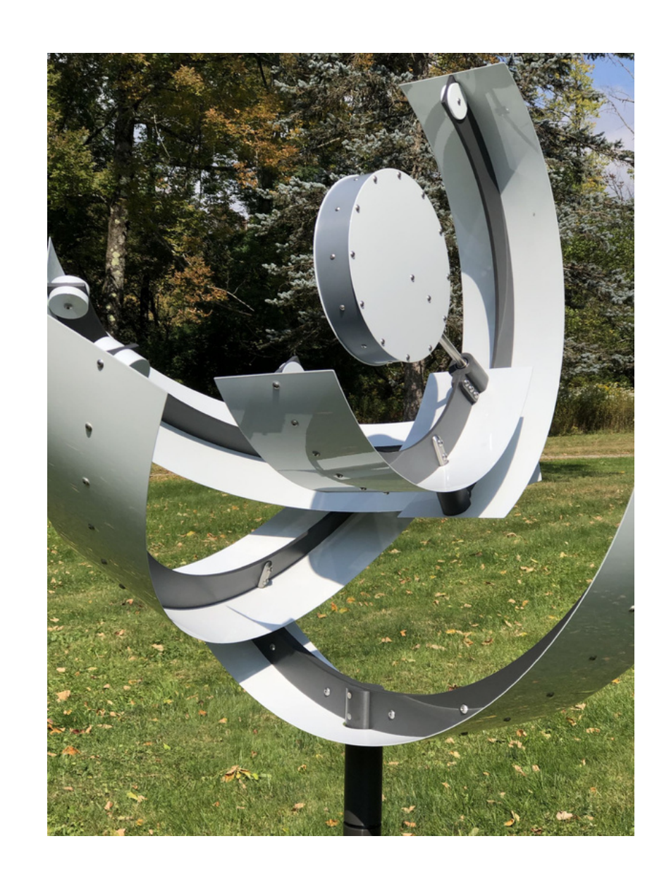
UNTITLED, 2020 Hardcoat Anodized Aluminum, painted aluminum, stainless steel 87 x 48 in.