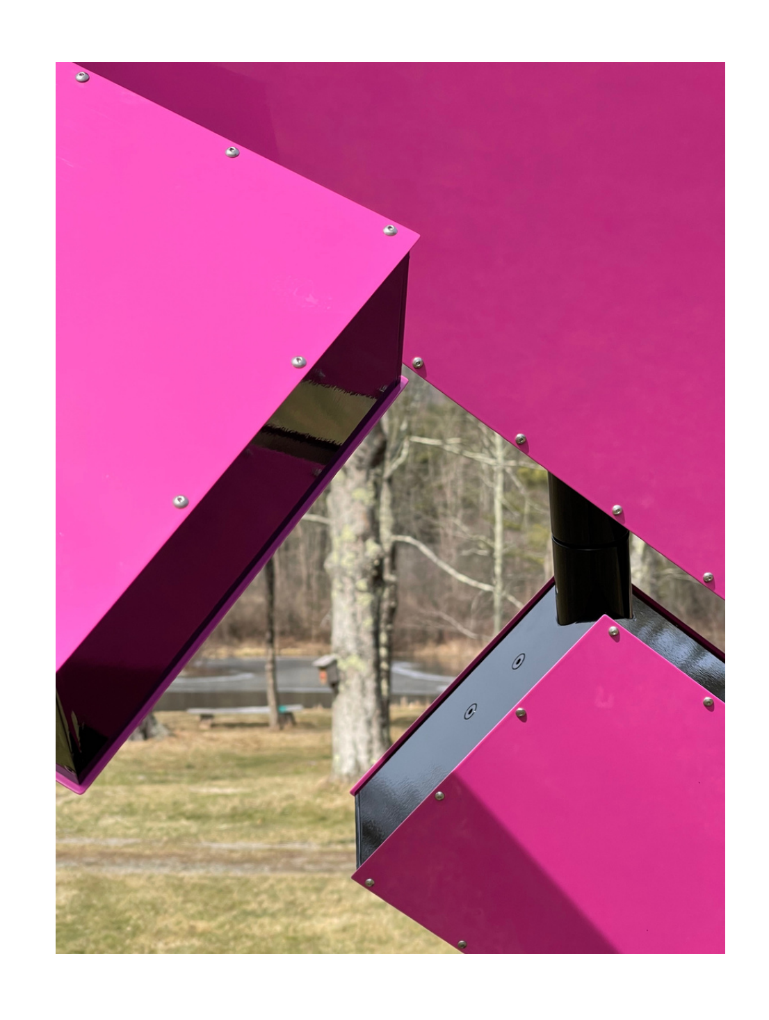
ZEPHYR, 2022 Hardcoat Anodized Aluminum, painted aluminum, stainless steel 123 x 119 in.