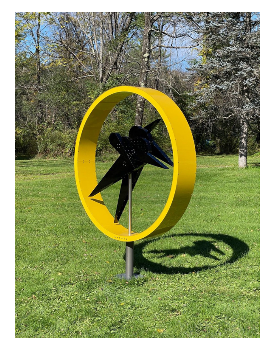
MEADOWLARK, 2021 Painted aluminum, stainless steel, brass, anodized aluminum 83 x 67 in.